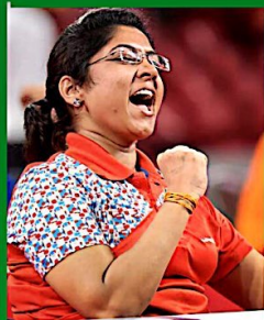
Table tennis player Bhavina Patel signed off with a historic silver medal in her maiden Paralympic Games after going down 0-3 to world number one Chinese paddler Ying Zhou in the women's singles class 4 final at Tokyo on Sunday. The 34-year-old Patel's impressive run at the Games ended with a 7-11 5-11 6-11 loss to Zhou, a two-time gold medalist, in the women's singles summit clash which lasted 19 minutes.

With this medal, Indian team opened its account at the Games